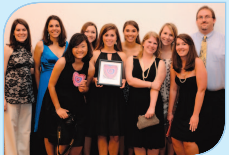
Birmingham Southern College students awarded Volunteers of the Year

To everyone who played a role in making the Gala such a success...we thank you so much. Let's do it again next year: May 1, 2010.