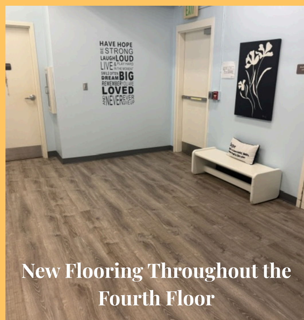
New Flooring Throughout the Fourth Floor