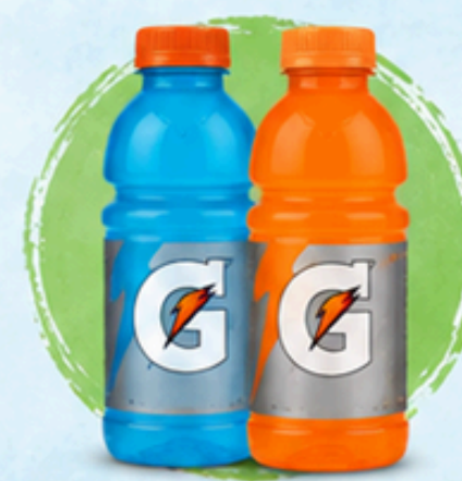
GATORADE OR SPORTS DRINKS