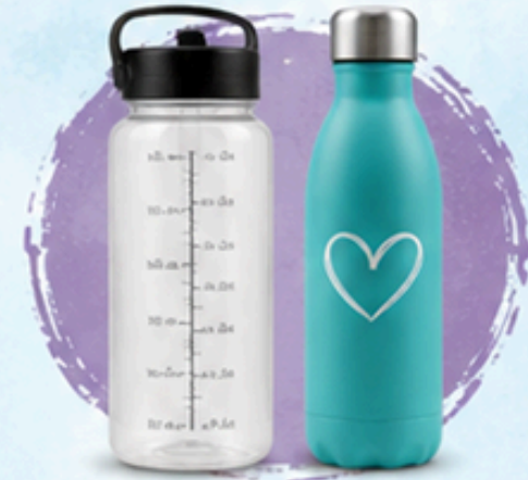
INDIVIDUAL WATER BOTTLES OR REUSABLE WATER BOTTLES