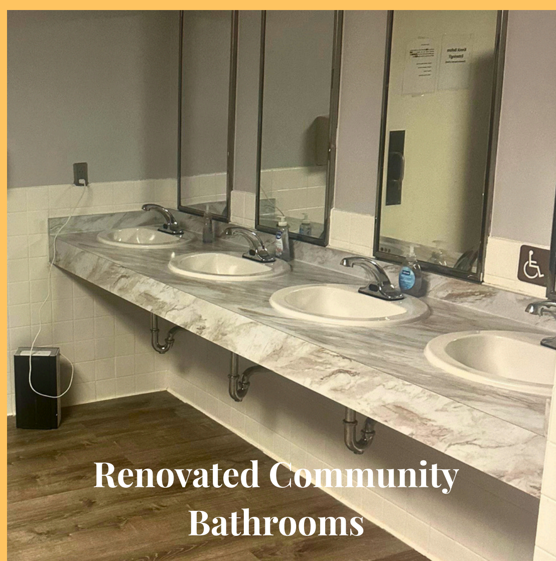
Renovated Community Bathrooms