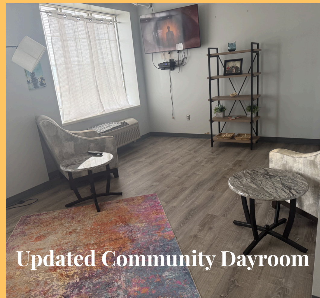
Updated Community Dayroom