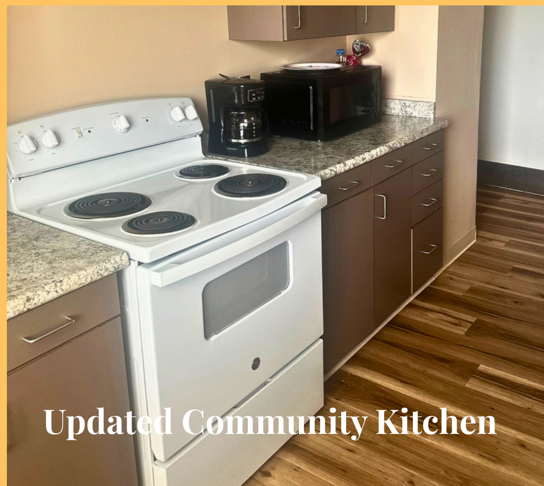
Updated Community Kitchen